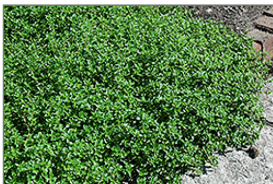
Spanish Thyme