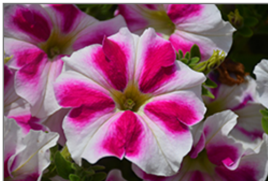
BigDeal Flamenco Dancer Petunia flowers

BigDeal Flamenco Dancer Petunia is recommended for the following landscape applications;