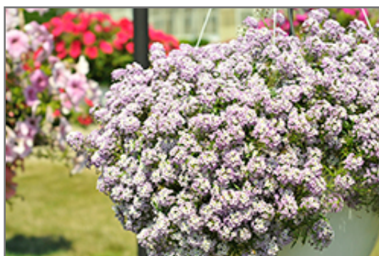
Lucia Lavender Sweet Alyssum in bloom