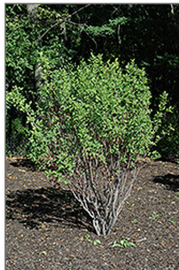
Rainbow Pillar Serviceberry

Rainbow Pillar Serviceberry is recommended for the following landscape applications;