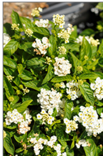
Gem Compact White Sapphire Lantana flowers