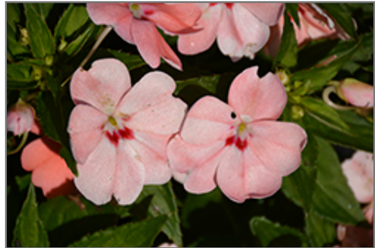
SunStanding Spot On Salmon Impatiens flowers