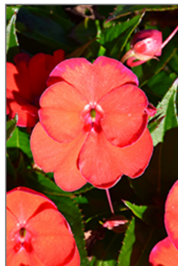
SunStanding Orange Aurora Impatiens flowers