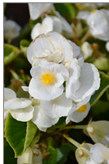
Super Cool White Begonia flowers

Super Cool White Begonia is recommended for the following landscape applications;