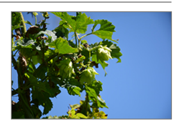
Magnum Hops fruit