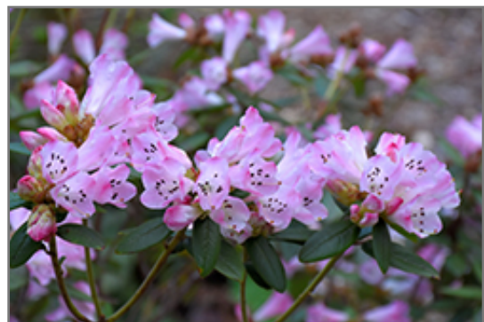
Seta Rhododendron flowers