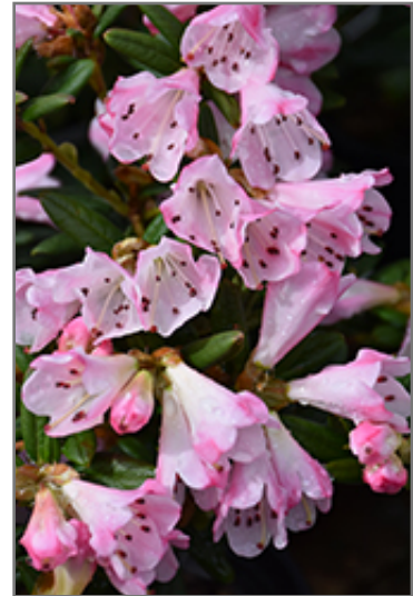
Seta Rhododendron flowers