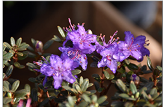
Dwarf Rhododendron flowers

Dwarf Rhododendron will grow to be about 24 inches tall at maturity, with a spread of 3 feet. It has a low canopy. It grows at a slow rate, and under ideal conditions can be expected to live for 40 years or more.