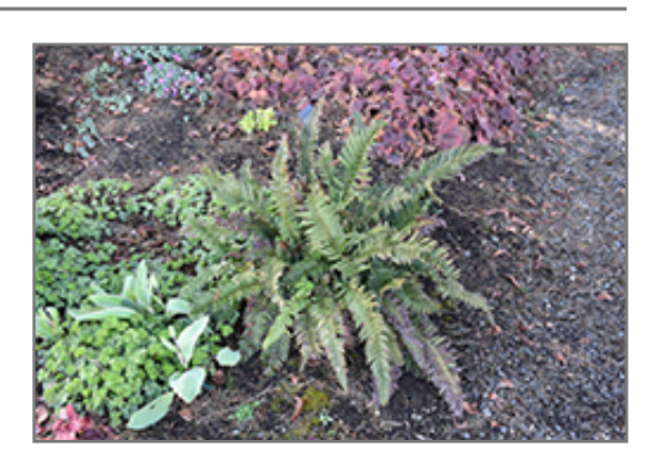
Shiny Holly Fern

Dark green, clean, shiny foliage with rigid edges, and coppery-brown scales on emerging fronds; excellent massed or as groundcover in shaded woodland borders or featured in shady areas of rock gardens