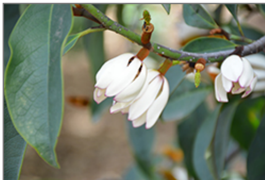
Fogg's #2 Magnolia flowers