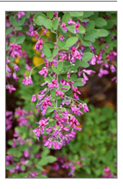
Little Volcano Bush Clover flowers

Little Volcano Bush Clover is recommended for the following landscape applications;