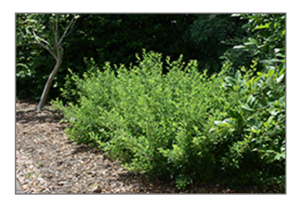
Little Volcano Bush Clover

Little Volcano Bush Clover will grow to be about 6 feet tall at maturity, with a spread of 10 feet. It tends to fill out right to the ground and therefore doesn't necessarily require facer plants in front, and is suitable for planting under power lines. It grows at a slow rate, and under ideal conditions can be expected to live for approximately 10 years.