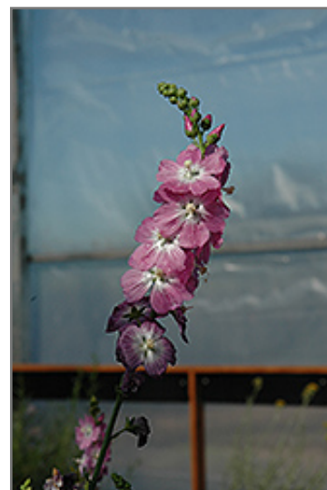
Stark's Hybrids Prairie Mallow flowers