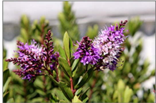
Veronica Lake Hebe flowers