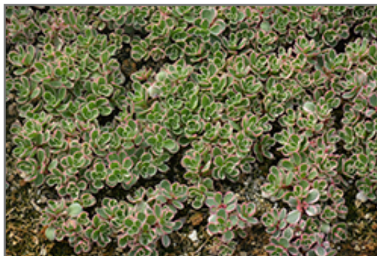
Tricolor Stonecrop flowers

Tricolor Stonecrop is a fine choice for the garden, but it is also a good selection for planting in outdoor pots and containers. Because of its spreading habit of growth, it is ideally suited for use as a 'spiller' in the 'spiller-thriller-filler' container combination; plant it near the edges where it can spill gracefully over the pot. Note that when growing plants in outdoor containers and baskets, they may require more frequent waterings than they would in the yard or garden. Be aware that in our climate, most plants cannot be expected to survive the winter if left in containers outdoors, and this plant is no exception. Contact our experts for more information on how to protect it over the winter months.