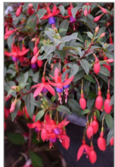
Army Nurse Fuchsia flowers