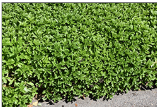
Selskian Stonecrop