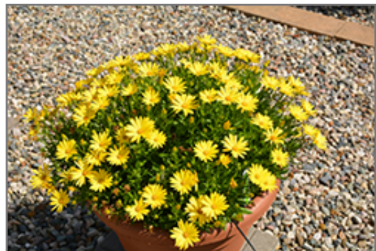
Ostica Glamour Osteospermum in bloom