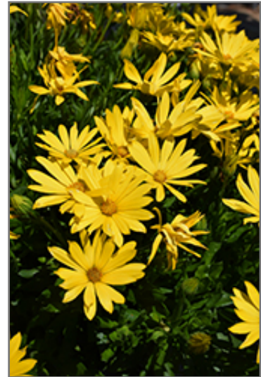
Ostica Glamour Osteospermum flowers

Ostica Glamour Osteospermum is recommended for the following landscape applications;