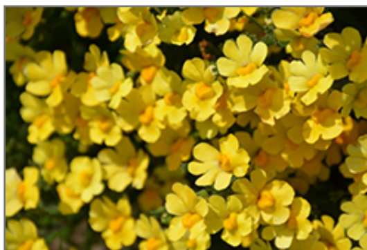
Nessie Plus Yellow Nemesis flowers