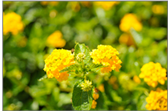
Landmark Gold Lantana flowers

Landmark Gold Lantana is recommended for the following landscape applications;