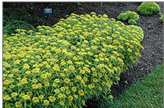
Aizoon Stonecrop in bloom