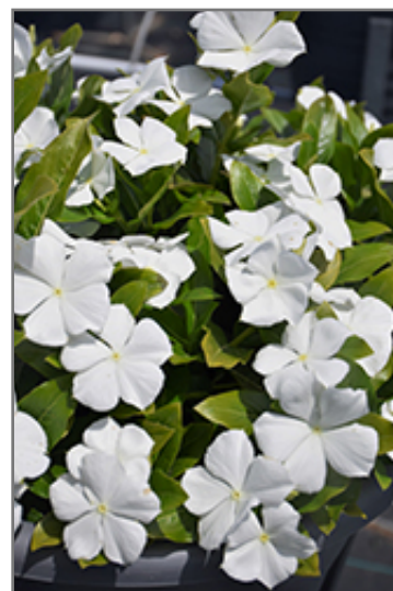
Cora Cascade White Vinca flowers