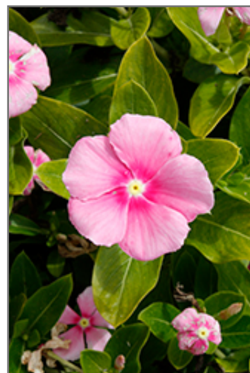
Cora Cascade Shell Pink Vinca flowers