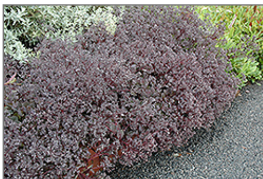
Bertram Anderson Stonecrop