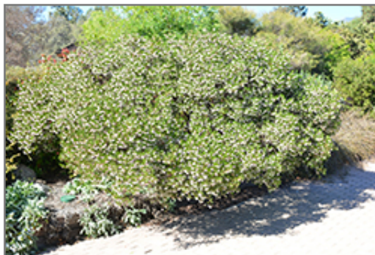
White Lanterns Manzanita in bloom