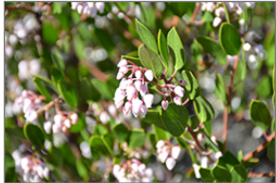
White Lanterns Manzanita flowers

This plant is not reliably hardy in our region, and certain restrictions may apply; contact the store for more information.