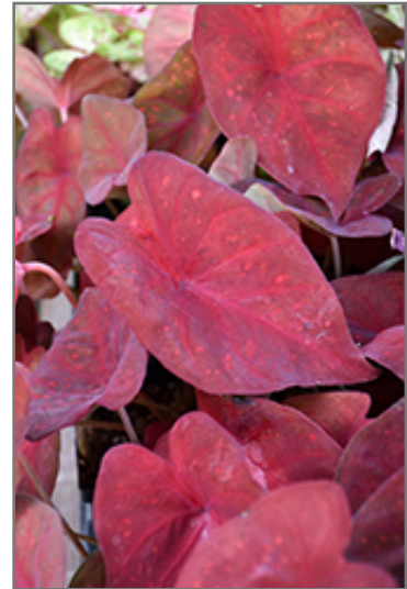
Burning Heart Caladium foliage