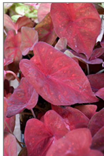
Burning Heart Caladium foliage