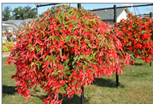
Bossa Nova Rose Begonia flowers