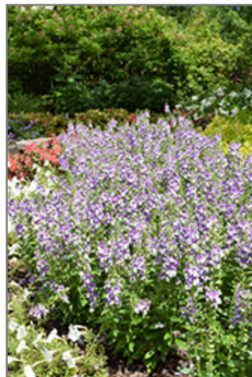
Alonia Big Bicolor Purple Angelonia in bloom

Alonia Big Bicolor Purple Angelonia is a fine choice for the garden, but it is also a good selection for planting in outdoor containers and hanging baskets. With its upright habit of growth, it is best suited for use as a 'thriller' in the 'spiller-thriller-filler' container combination; plant it near the center of the pot, surrounded by smaller plants and those that spill over the edges. Note that when growing plants in outdoor containers and baskets, they may require more frequent waterings than they would in the yard or garden.