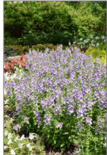
Alonia Big Bicolor Purple Angelonia in bloom

Alonia Big Bicolor Purple Angelonia is a fine choice for the garden, but it is also a good selection for planting in outdoor containers and hanging baskets. With its upright habit of growth, it is best suited for use as a 'thriller' in the 'spiller-thriller-filler' container combination; plant it near the center of the pot, surrounded by smaller plants and those that spill over the edges. Note that when growing plants in outdoor containers and baskets, they may require more frequent waterings than they would in the yard or garden.