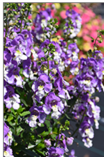
Alonia Big Bicolor Purple Angelonia flowers

Alonia Big Bicolor Purple Angelonia is recommended for the following landscape applications;