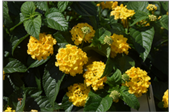
Lucky Yellow Lantana flowers