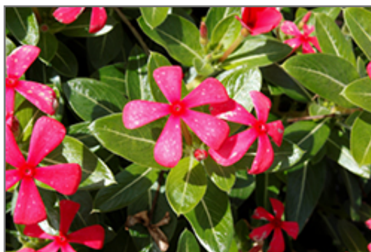
Soiree Kawaii Red Shades Vinca flowers

Soiree Kawaii Red Shades Vinca is recommended for the following landscape applications;