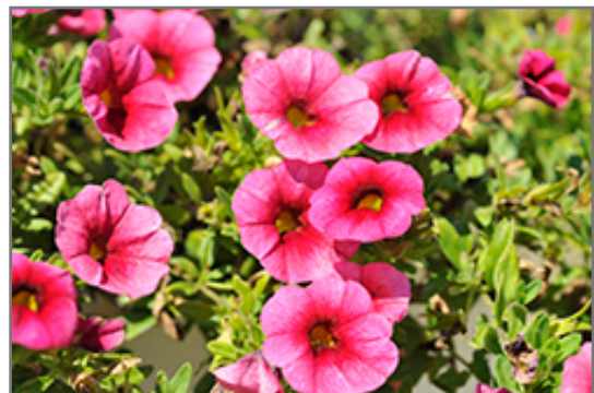
Colibri Malibu Pink Calibrachoa flowers