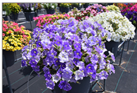
FlashForward Sky Blue Petunia in bloom