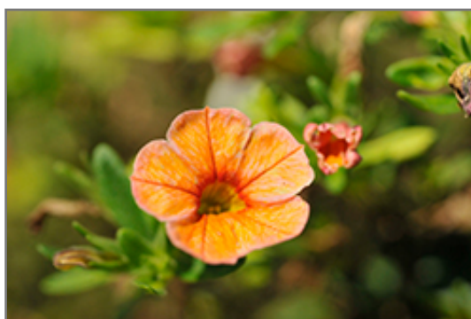
Cha-Cha Tangerine Calibrachoa flowers