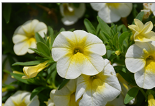
Cha-Cha Frosty Lemon Calibrachoa flowers