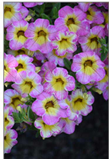
Cha-Cha Diva Hot Pink Calibrachoa flowers