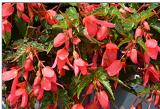
Groovy Rose Begonia flowers

Groovy Rose Begonia is recommended for the following landscape applications;