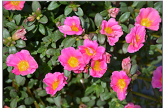
Pazzaz Sweet Pink Portulaca flowers

Pazzaz Sweet Pink Portulaca is recommended for the following landscape applications;