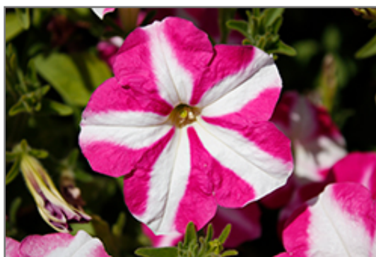
FotoFinish Rose Star Petunia flowers