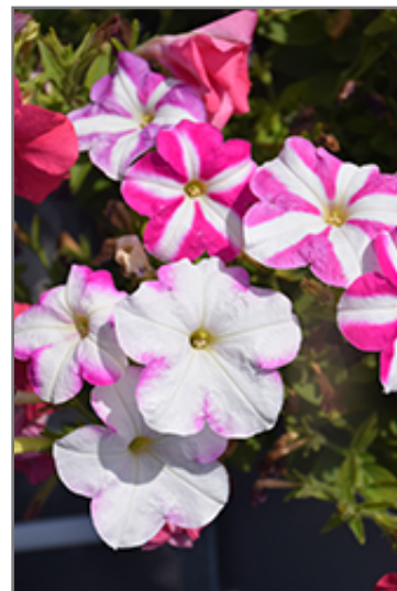
FotoFinish Rose Star Petunia flowers

FotoFinish Rose Star Petunia is recommended for the following landscape applications;