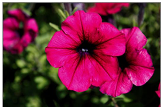
FotoFinish Burgundy Petunia flowers