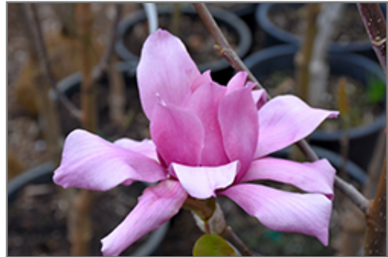
Vulcan Magnolia flowers

A hybrid magnolia selected for the deep ruby red color of its large, cup-shaped flowers; blooms tend to be more pink on younger plants; a large shrub, or elegant small tree with an upright habit, it makes a fine ornamental specimen for smaller yards