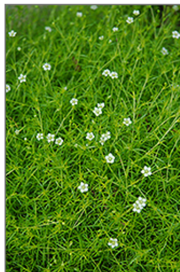
Scotch Moss flowers

Scotch Moss will grow to be only 1 inch tall at maturity, with a spread of 12 inches. Its foliage tends to remain low and dense right to the ground. It grows at a medium rate, and under ideal conditions can be expected to live for approximately 10 years. As an evergreen perennial, this plant will typically keep its form and foliage year-round.