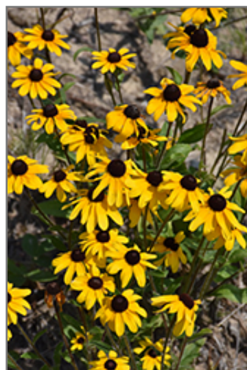
Black-eyed Susan flowers