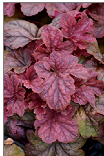
Peach Tea Foamy Bells foliage