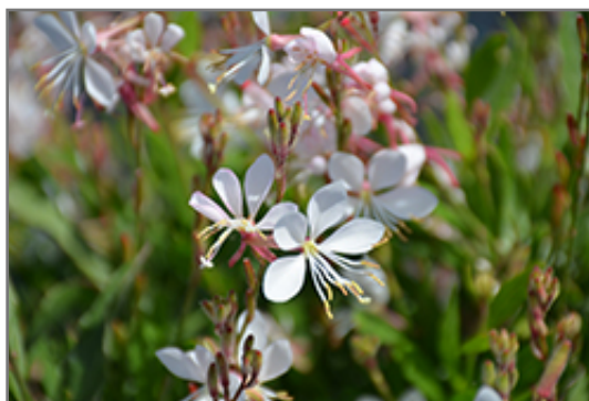
Graceful White Gaura flowers