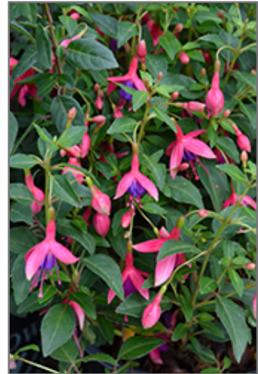
Peter Pan Fuchsia flowers