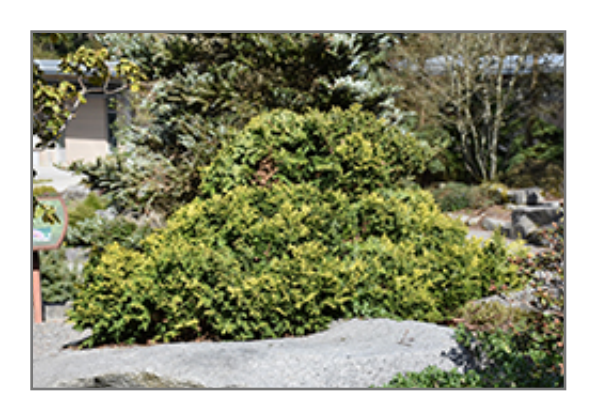
Stoneham Hinoki Falsecypress

This is a relatively low maintenance shrub. When pruning is necessary, it is recommended to only trim back the new growth of the current season, other than to remove any dieback. It has no significant negative characteristics.