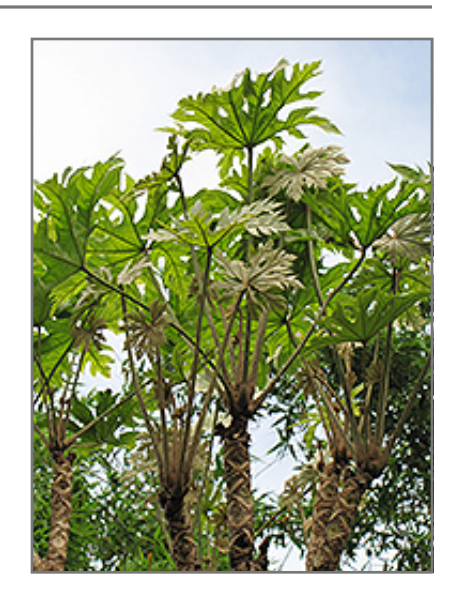
Snowflake Aralia foliage

This tree will require occasional maintenance and upkeep, and should not require much pruning, except when necessary, such as to remove dieback. Gardeners should be aware of the following characteristic(s) that may warrant special consideration;