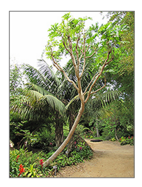
Snowflake Aralia