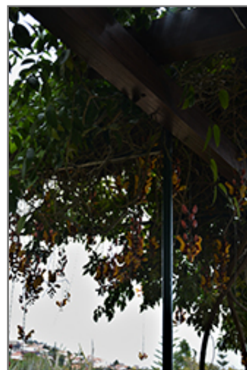
Brick & Butter Vine in bloom

This plant is not reliably hardy in our region, and certain restrictions may apply; contact the store for more information.