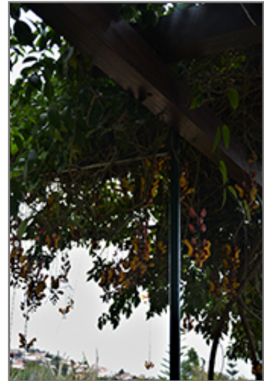
Brick & Butter Vine in bloom

This plant is not reliably hardy in our region, and certain restrictions may apply; contact the store for more information.