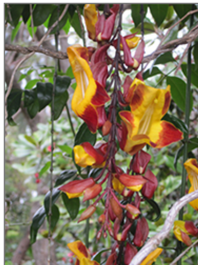
Brick & Butter Vine flowers